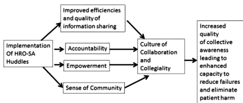
Figure 2 Proposed model of how emerging themes/concepts might work together to improve collective awareness, reduce failures and improve patient care. HRO, high-reliability organisation; SA, situation awareness.

The construct of empowerment has been defined in many ways, depending on the context in which it is