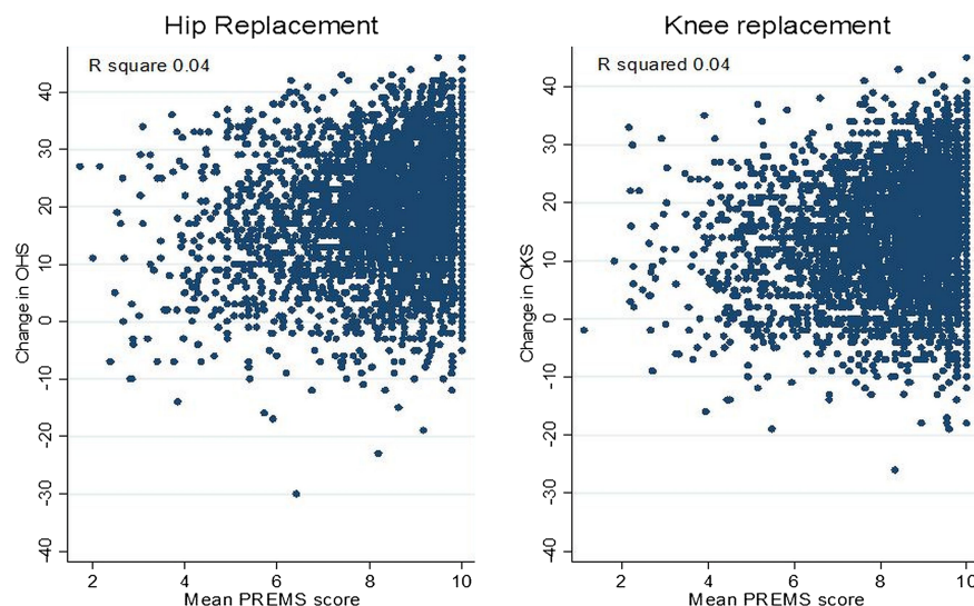
Figure 2 Association between outcome (change in disease-specific PROM score) and overall PREM score. PREM, patient reported experience measure, PROM, patient reported outcome measure.

were patients' views of communication with and trust in doctors and, to a lesser extent, nurses.