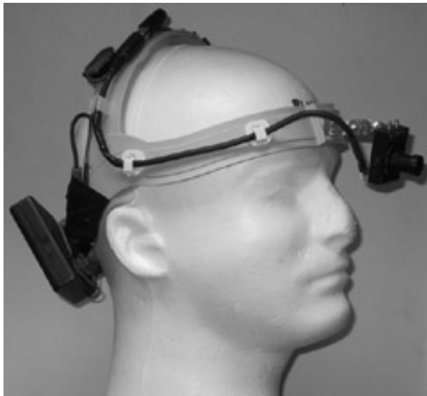
Figure 4 The wireless head camera had four AA batteries in a box mounted over the occiput. The camera was on a swivel mount between the eyes. The video transmitter was positioned in the middle of the 10 resuscitation bay trauma resuscitation unit layout and allowed free range movement with image transmission over about 100 feet.

occurred with night and day shift nursing staff. Medical staff meetings were also arranged for surgeons, anaesthesiologists, and orthopaedists. The most frequently asked questions were then discussed at a weekly multidisciplinary staff meeting (medical/nursing/technicians) and all questions were answered in both group settings and one-on-one informal meetings. Protocols for specific video recording research were planned with all the major stakeholders. Protection of human subjects (both patients and care providers) was secured through a formal approval process by the Institutional Review Board (IRB). Consent forms were distributed and discussed extensively with the research subjects who would be video recorded. An approach for information sharing about video recording is shown in fig 5.