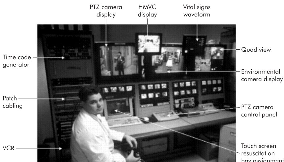
Figure 2 Telecontrol centre showing three full screen displays above 28 small screen individual camera images. The right full screen displays the “quad” image. The two stand out screens between the full screen monitors display the vital sign waveform data (on right) and the wireless head camera image (on left). The touch screen panel (above keyboard) allows the video technician to display any one of the video instrumented locations with a single key touch. The time code generator and patch board is shown to the left of the video technician. Four video cassette recording machines (VCR) are arranged in the rack beneath the video patch board.

When the first protocol involving video recording was to be introduced, the following strategy was employed to facilitate clinician acceptance. An “open house” was arranged showing typical views and marking the location in the trauma resuscitation unit that would be included in the video image. Several meetings were held at which one-on-one discussions