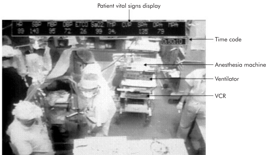
Figure 1 Operating room activity with overlay of patient vital signs: HR=heart rate; SBP, MBP, DBP=systolic, mean, and diastolic arterial pressure; ET CO =end tidal CO 2 pressure; SaO 2 =O 2 saturation; TMP=temperature (°C); SPA, DPA=non-invasive blood pressure or pulmonary artery pressure when used. Time code is shown at the bottom right of the vital signs display. The videocassette recorder (VCR) is seen two shelves from the bottom of the anesthetic machine/ventilator module. Facial features are blurred.

The third upgrade of video acquisition capability included instrumenting all the trauma resuscitation unit bays and six operating rooms with multiple ceiling mounted cameras. 13 In addition, a wireless head mounted camera was designed and built to allow image retrieval from operators during emergency tasks (fig 4). An infrared mobile wireless audio