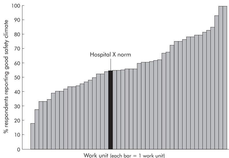
Figure 2 Safety climate across 49 work units in one hospital.

climate) and measure the entire hospital annually; this has already been done at the Johns Hopkins Hospital. We found that when you measure and feedback data in one work unit, other units quickly desire their own cultural assessment as well. The Safety Attitudes Questionnaire is the most widely used cultural assessment tool in health care to date. In the past 12 months we have assessed culture in over 100 hospitals with an average hospital-wide response rate of over 80%. Representativeness is critical as it makes the data easy to interpret and difficult to ignore. This is particularly true in pre-post or longitudinal cultural assessments where high response rates are essential to interpreting data over time. When response rates fall below 60%, the data represent opinions rather than culture