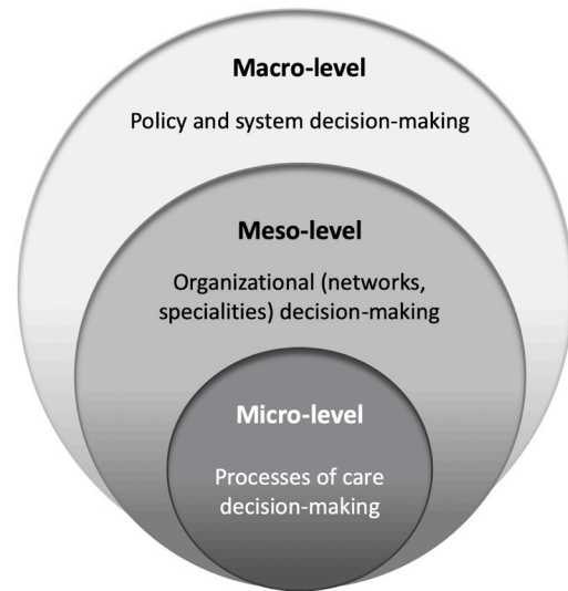
Figure 1 Decision-making contexts across healthcare systems.

We applied qualitative methods 39 in a multiphase approach, comprising a review to examine actionability according to the published literature 40 and multiple perspective semistructured interviews 39 41 42 to gain insights from two groups (panels) representing the scientific community and data users. We employed one-on-one interviews following our literature review rather than a questionnaire or focus groups for richer exchanges and the possibility to elicit the individual opinions of each participant. 43 Our stepwise approach to analysis allowed for the triangulation of findings across phases and to aggregate individual-level