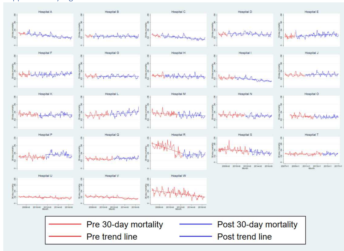
Supplementary Figure 2

Raw unadjusted monthly 30-day mortality rate at the 23 hospitals in Denmark from 2007-2016. Hospital U, V, and X have not reconfigured and therefore only consist of an before period. Red line represents the 30-day mortality rate before the reconfiguration. Blue line represents the 30-day mortality rate after the reconfiguration.