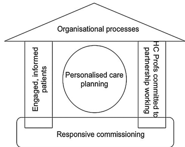
Figure 1 House of Care. Reproduced with permission of The King's Fund. Source: Coulter A, Roberts S, Dixon A (2013). Delivering better services for people with long-term conditions: building the house of care . London: The King's Fund. Available at: http://www.kingsfund.org.uk/publications/delivering-better-services-people-long-term-conditions

The concentric circles around the interactions between patients and professionals suggest that these